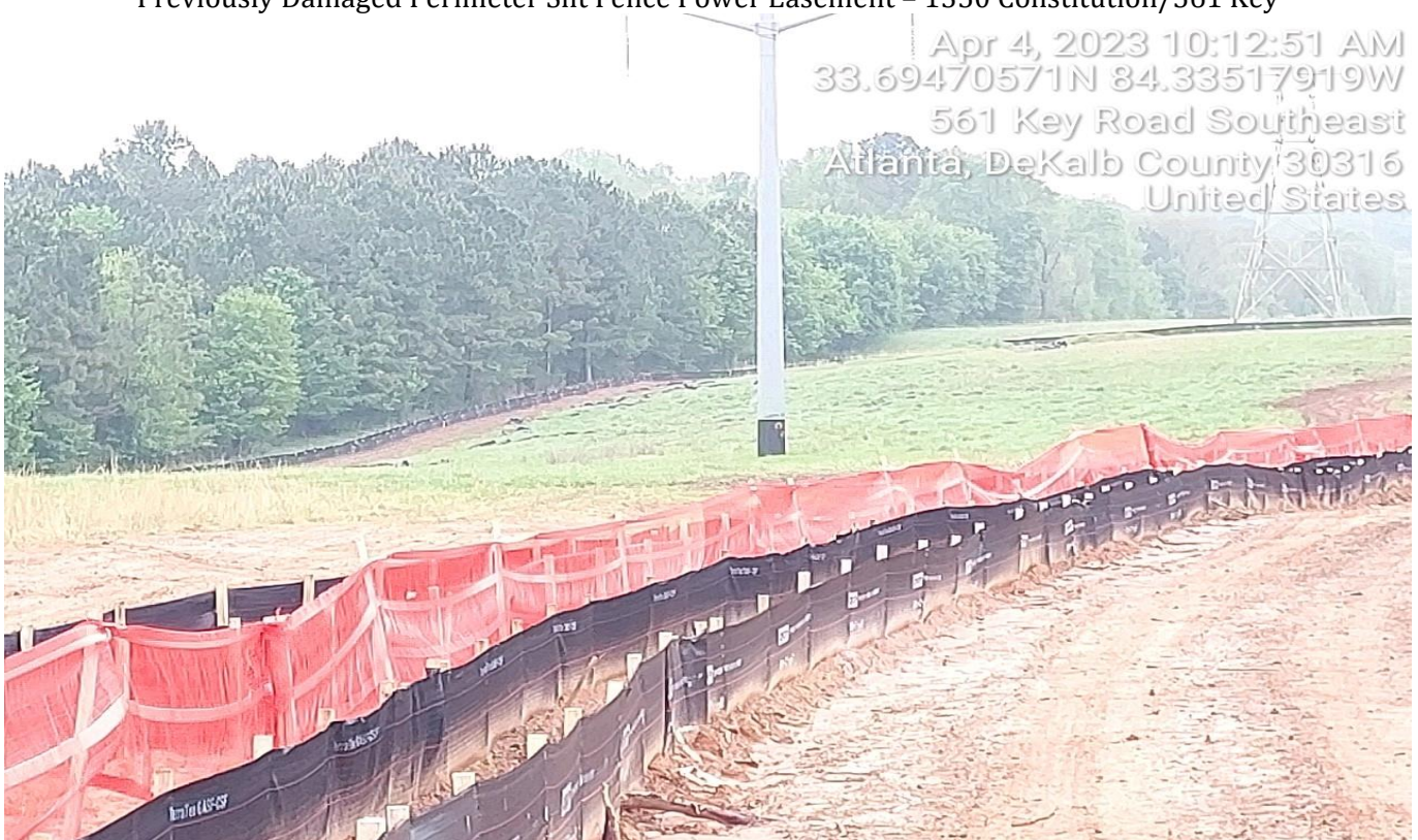
Previously Destroyed Perimeter Silt Fence at Power Easement Area