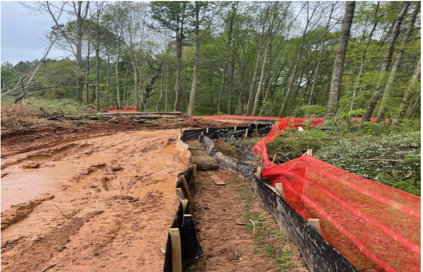
Silt fence repaired where fallen tree damage took place; Hay bales and an extra row of silt fence was added for additional stabilization