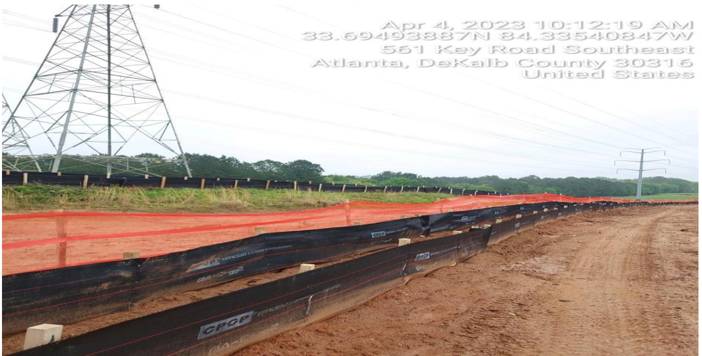
Previously Damaged Perimeter Silt Fence Power Easement - 1350 Constitution/561 Key