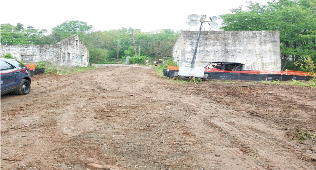
ENTRANCE on KEY ROAD (33.69685841N 84.33796873W)

Apr 4, 2023 10:43:39 AM 33.69685841N 84.33796873W 1300 Key Road Southeast Atlanta, DeKalb County 30316 United States